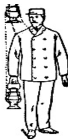
b. A hand, flag, or lantern waved vertically means go Forward.