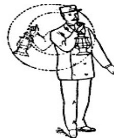
c. A hand, flag, or lantern waved in a circle means to Back.